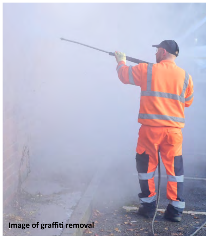
Image of graffiti removal